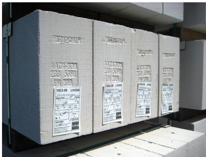
Figure 9: Material Identification

Reinforced panels are marked before autoclaving with a stamp code containing information about date of production, mould number, project number and placement position.