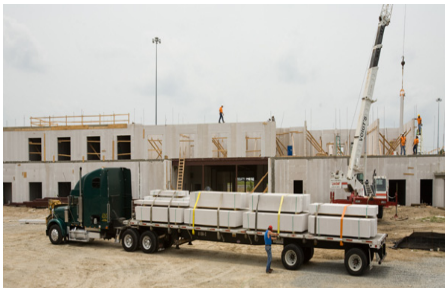
Figure 10: Hebel AAC Delivery to Project Site

Hebel AAC is shipped by trucks, platforms, or multimodal containers, etc. They can be transported by road, train and by sea for international projects. Hebel block and panel pallets should be handled by forklift trucks and/or cranes with appropriate straps to avoid damage to the material.