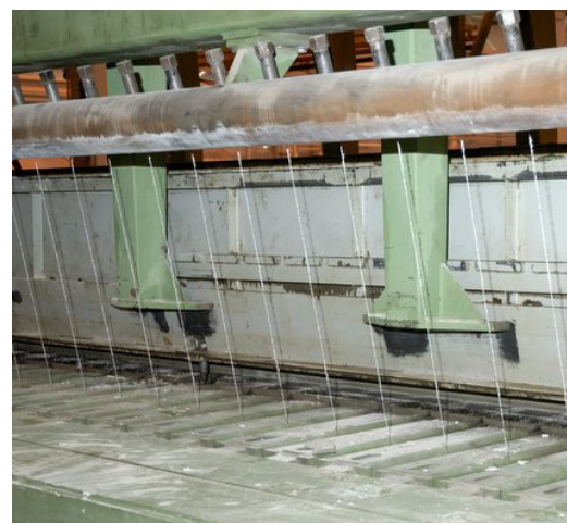
Figure 4: Cutting Machine with steel wires

After mixing, the slurry is poured into metal moulds in which the expanding agent reacts with the other elements. The mixing results in a reaction where small, finely-dispersed air spaces are formed. The moulds are sent to a pre-curing room for several hours. Next, the semi-solid material is transported to the cutting machine where the cuts are made using steel wires to form the sizes required for the building elements. The product consistency combined with our high precision cutting technology, results in pieces with dimensional tolerances for blocks (w, h, l) \pm 1/8" and for panels (w, h) \pm 1/8" , (l) \pm 1/5" .